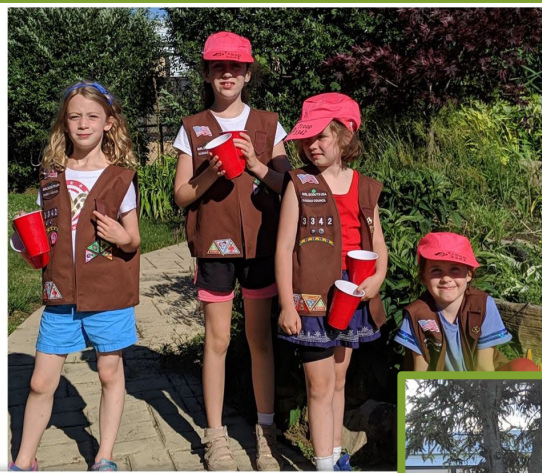
TROOP 3342 - 2019 / BROWNIES LEVITTOWN OUTDOOR LEARNING CENTER THEY STUDIED HUMMINGBIRDS, GIRLS PLANTED AND MADE SYRUP FOR THE BIRD FEEDERS